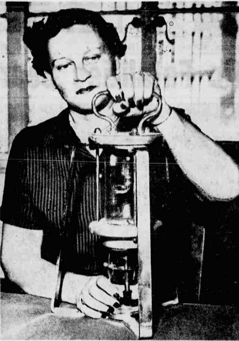
CANCER QUACKS—Each year thousands of persons stricken with cancer and other diseases turn to groups and individuals who promise "cures." Scores of devices used by these quacks have been seized and their inventors and peddlers jailed and fined. The metal and glass "cure-all" shown here is one such device. Offered for sale to federal inspectors for $10,000, it was found to contain $1.60 worth of radium. Drinking the glass of water "radon-activated" by the device was supposed to effect the cure.

Health Movement A number of purveyors of cures operate under the guise of a "health freedom movement." They support the right to practice of "any doctor wishing to administer particular therapeutic treatments, as permitted under their licenses to practice." But, they do not say "no" to such doctors as so-called "drugless healers," that their licenses do not permit them to practice medicine; that they are not properly trained or qualified to dis-