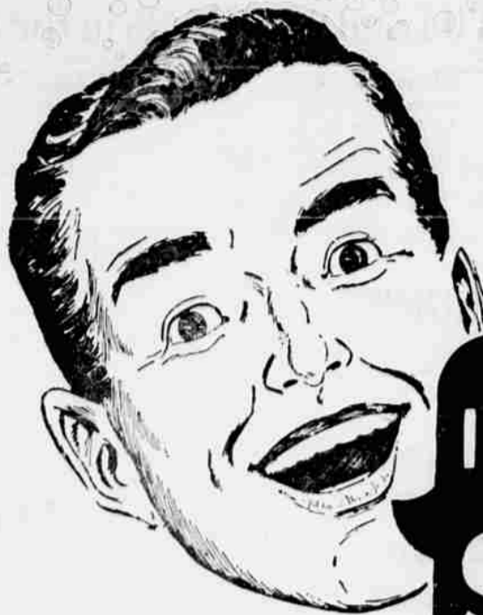
Our shelves are loaded with money-saving specials to help stretch your budget dollars.