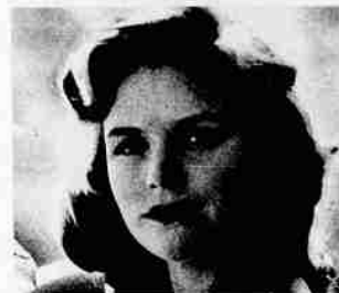
MOST PROMISING NEW STAR: Lee Remick (Runner-up: Troy Donahue)