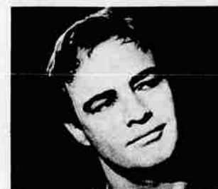
WORST-DRESSED MALE STAR: Marlon Brando (Runner-up: Tony Perkins)