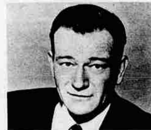
MOST OVERPAID STAR: John Wayne (Runner-up: Marilyn Monroe)