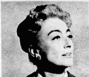
BEST-DRESSED FEMALE STAR: Joan Crawford (Runner-up: Audrey Hepburn)