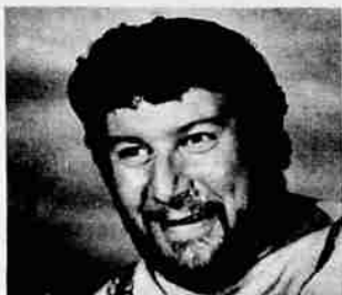
MOST INTELLECTUAL STAR: Peter Ustinov (Runner-up: Orson Welles)