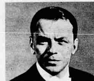
MOST OUTSPOKEN STAR: Frank Sinatra (Runner-up: Eva Marie Saint)