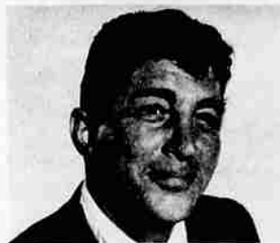
STAR MOST FUN TO BE WITH: Dean Martin (Runners-up: Tony Randall, Liz Taylor, David Niven)