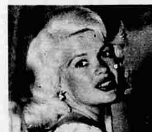
MOST PRETENTIOUS STAR: Jayne Mansfield (Runner-up: Zsa Zsa Gabor)