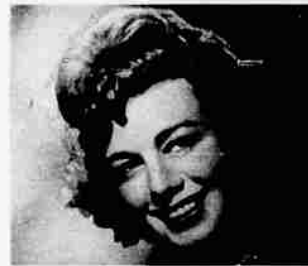
WORST-DRESSED FEMALE STAR: Shelley Winters (Runners-up: Marilyn Monroe and Shirley MacLaine)