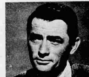
STAR MOST LACKING IN HUMOR: Gregory Peck (Runners-up: Glenn Ford, Charlton Heston, Debbie Reynolds)