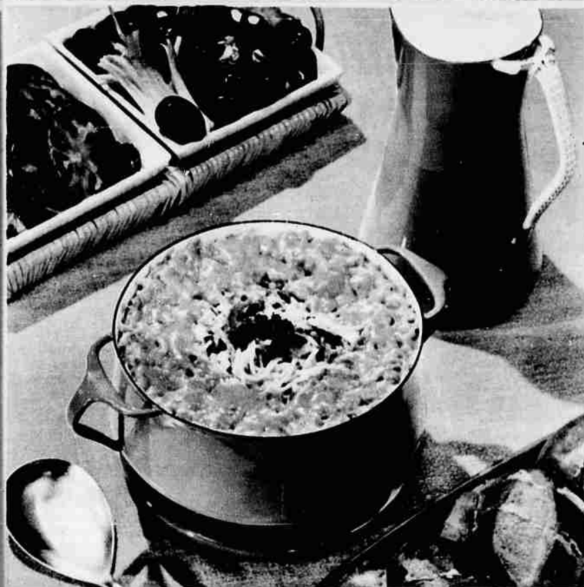
This hearty casserole boasts a zesty blend of sour cream and cottage cheese.