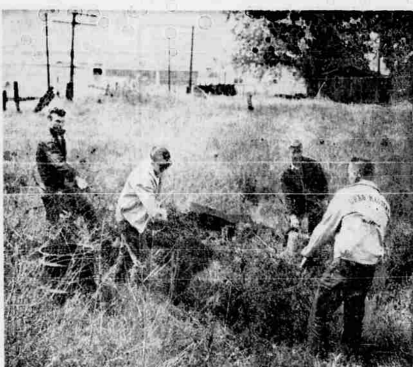
CLEAN UP —As part of the current Medford Junior Chamber of Commerce community development and clean up program, members of the Drag Master Car club are shown above cleaning up a lot on the South Pacific highway. Other groups actively involved in the city-wide promotion have been Brownie troop 43, who have cleaned up paper on Oakdale and J sts. near the high school; Girl scout troop 193; and Troop 212, who has helped by picking up paper and trash near the St. Mary's school.