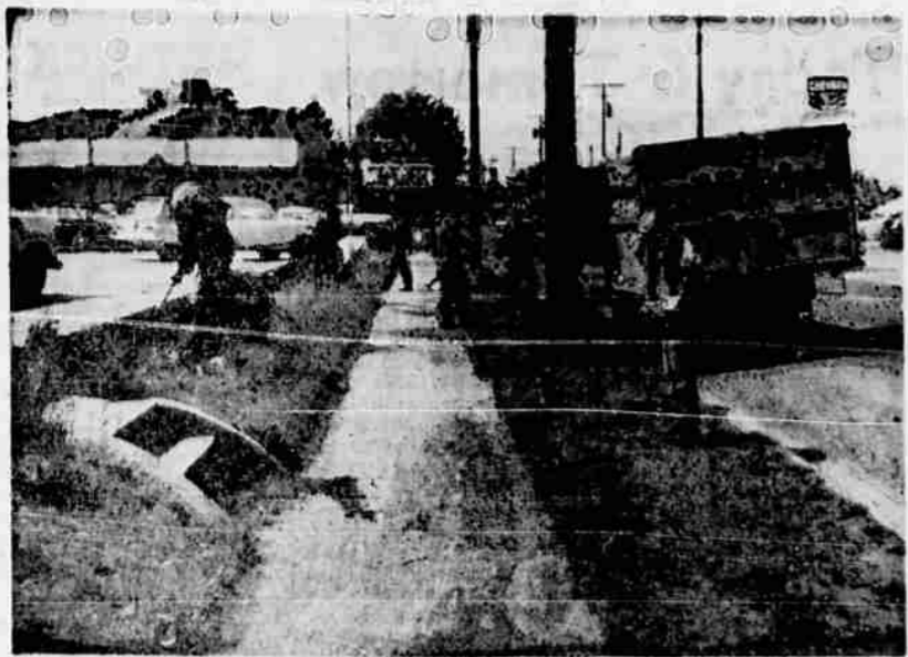
GUARD HELPS —Also participating in the local campaign is Company E of the National Guard. Unit members are shown cleaning portions of Riverside ave. recently. Actively engaged in the same project is the Civil Air Patrol which has volunteered its cadets to help the Medford Jaycees Community Development committee in June. Up to now, many cadets have assisted the cause by doing "beautification" work around their headquarters at the Medford Municipal airport.