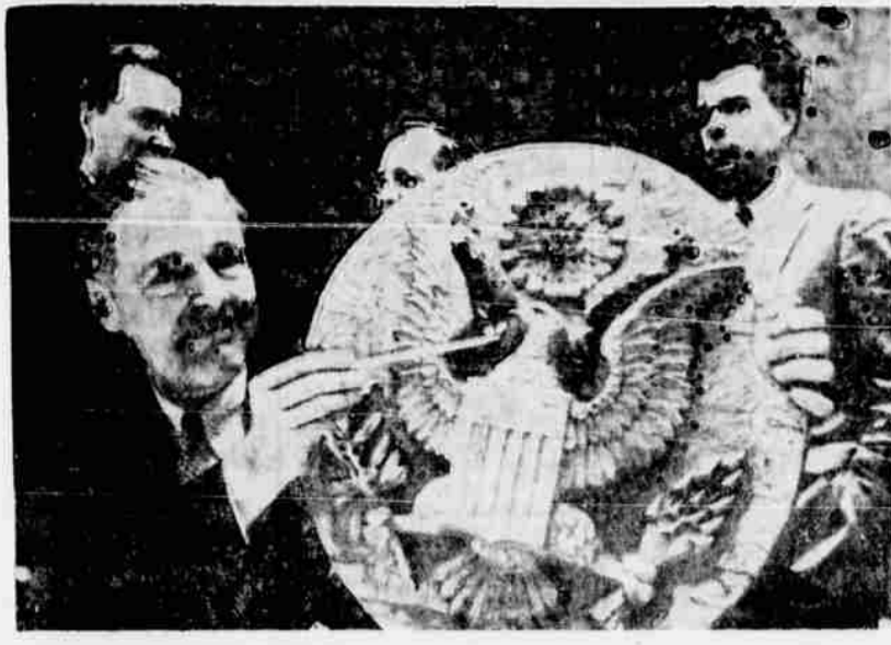
SEAL SAID BUGGED —United States Ambassador to the United Nations, Henry Cabot Lodge, shows a replica of the Great Seal of the United States to the Security Council, Lodge told the Council that a "clandestine listening device" had been planted in the seal, which had been presented to the American Embassy in Moscow by the Soviets.