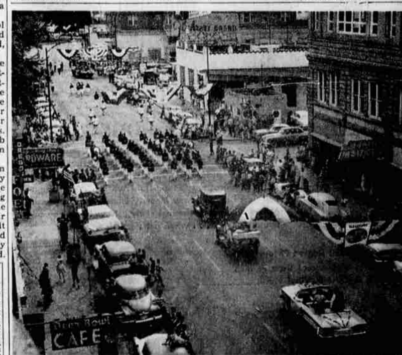
LOVE A PARADE - All Jackson county seemed to follow the theme music of the Medford high school band, "I Love a Parade," Saturday as an Oregon State Elks association parade wound through Medford's business section. A panorama shot down West Main st. shows a high school band, ancient cars hauling Elks notables and youngsters straying out from the curb. The parade down the bunting-draped streets was estimated as a mile long. It included several marching bands, novelty floats, cars, a clown, and the Salvation Army's disaster truck bringing up the rear to catch any marcher who was wilted by the sultry 77-degree weather Saturday.

Portland - (UPI) - Sen. Stuart Symington (D-Mo.) charged the Eisenhower administration Saturday night with lacking confidence in the future of America and with a refusal to invest in it.