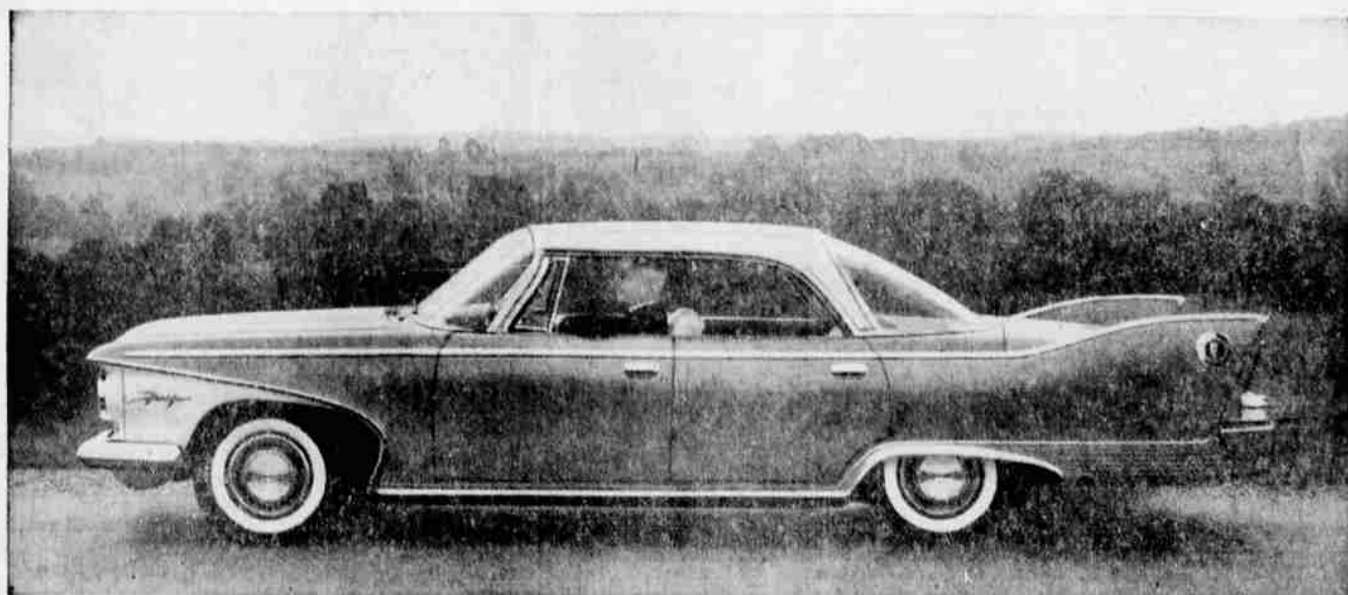
A Chrysler-engineered product, built a new solid way to give you solid satisfaction. See "THE STEVE ALLEN PLYMOUTH SHOW" Monday nights, NBC-TV. Solid!

This Plymouth's got everything—and that's the beauty of it. A V-8 engine that really goes when you tell it to. Sleek good looks that suit your modern taste. And, inside, a new one-piece welded Unibody that's tight and solid. It's the Plymouth Fury and it's waiting right now to take you for a spin. Make arrangements to give it a good whirl at your Plymouth dealer's soon.