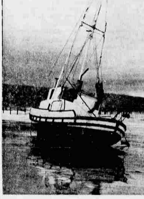
BOAT BEACHED—A fishing boat lists on the sands at Princeton, Calif., after a tidal wave caused by week end earthquakes lashed the California coastline. Damage to boats at Princeton was extensive but no one was hurt.

Public misunderstanding also has handicapped the program, according to a spokesman for the National Association of Public School Adult Educators. "Many people who would enjoy and profit from adult courses shy a way because they have the idea that adult education is solely for those who didn't get much schooling when they were young," he said. "Others have the false idea that adult courses are mainly recreational, artsy-craftsy stuff." "Actually, the role of adult education is to help individuals to continue to grow throughout life. In this complex and fast-changing world today, no one ever really completes his education. There are always new things to learn, new insights to gain, new cultural frontiers to explore."