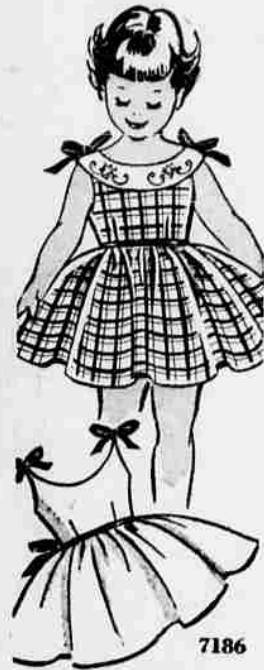
7186 by Alice Brooks

Cool scooped-neck pinatore becomes a party-pretty dress - by adding the separate collar! She'll love this style, you will too - it's sew-very-easy!