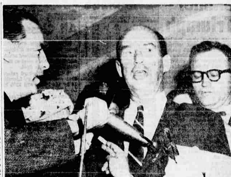
STEVENSON QUIZZED—Adlai Stevenson, two-time presidential candidate, is questioned by newsmen concerning the summit crisis following his appearance before a Senate communications subcommittee. Stevenson said if Nikita Khrushchev "wants to make progress he can by staying at the summit." Stevenson's statement was made before collapse of the talks Tuesday.

3. I believe that in the future Oregon will have to make some changes in its tax structure, as the tax burden on property is becoming excessive. More services are being asked by the people and the cost of the Government is constantly increasing. Under these conditions it is necessary that something be done to meet these problems. Oregon's taxes have been a source of controversy for many years. The legislature has set up Interim Committees to study taxation. I feel that the only answer to the problem under the present conditions is to get more for the present tax dollar. Examine expenditures for State services carefully. Increase the income tax base so that everyone will contribute their fair share to Government support. Institute a Business Tax. Increase Corporate Excise Tax, or increase the Property Tax. The last three proposals I do not advocate under present conditions.