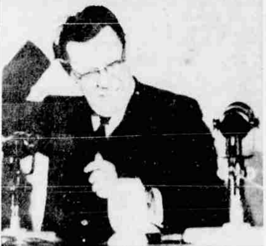
STATEMENT DELIVERED - Presidential Press Secretary James Hagerly wipes his head while delivering President Eisenhower's statement at a press conference following the opening session of the summit conference. The President accused Premier Khrushchev of coming to Paris just to sabotage the summit talks.