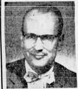
Vote for Dellenback

There is also laughing in the Nixon office over the slogans used by two Democratic presidential contenders listed on the ballot—Wayne Morse, "the candidate who votes the way he talks," and Hubert