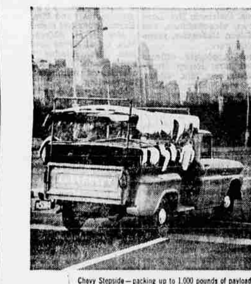
Chevy Stopside—packing up to 1,000 pounds of payload.