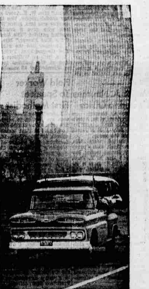
3 "Handles like a car," driver reports. Chevy's famous for it.

No wonder, is it, that Chevrolet's famous Thriftmaster 6 is the most widely used truck engine on the road? Well, truck owners have good things to say about all Chevy engines. And when they're not talking about Chevy performance and economy, they're telling you how great that new Torston-Spring Ride is. No question about it, Chevy's independent suspension works as beautifully in a big-tonnage tandem as it does in a pickup. Soaks up road shock that can beat a truck to death before its time. Protects fragile loads. Makes life easier for the driver. Lets you travel at faster safe speeds, even off the road, to get more done in a day. Drive a torsion-spring Chevy truck soon. We'll rest our case on that one ride.