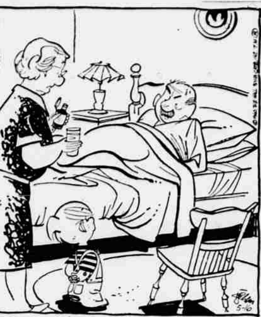
"NO, MY STOMACH ISN'T SHOLLEN! IT JUST HURTS."