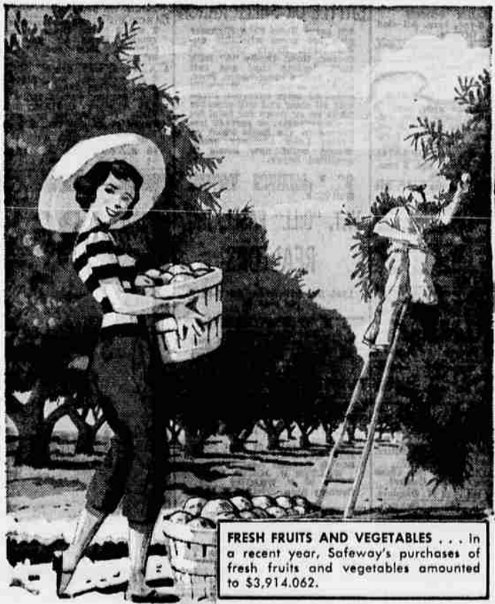
FRESH FRUITS AND VEGETABLES . . . In a recent year, Safeway's purchases of fresh fruits and vegetables amounted to $3,914,062.

Enjoy these finest Oregon grown or produced products!