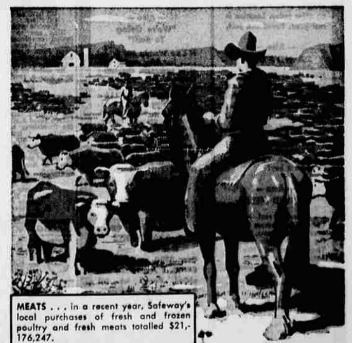
MEATS . . . In a recent year, Safeway's local purchases of fresh and frozen poultry and fresh meats totalled $21,176,247.