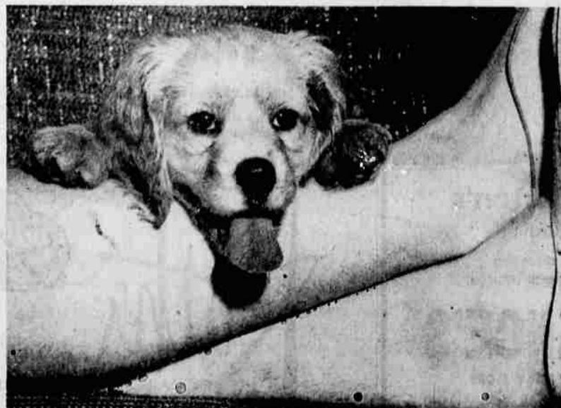
"Time for lunch yet?"