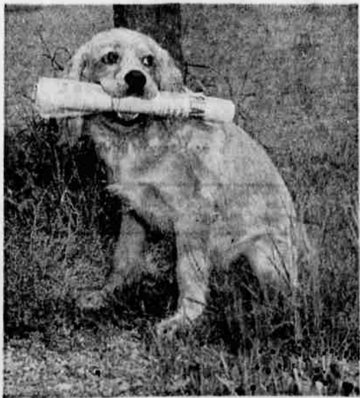
"Shall I put it on the porch or take it to the back yard?"