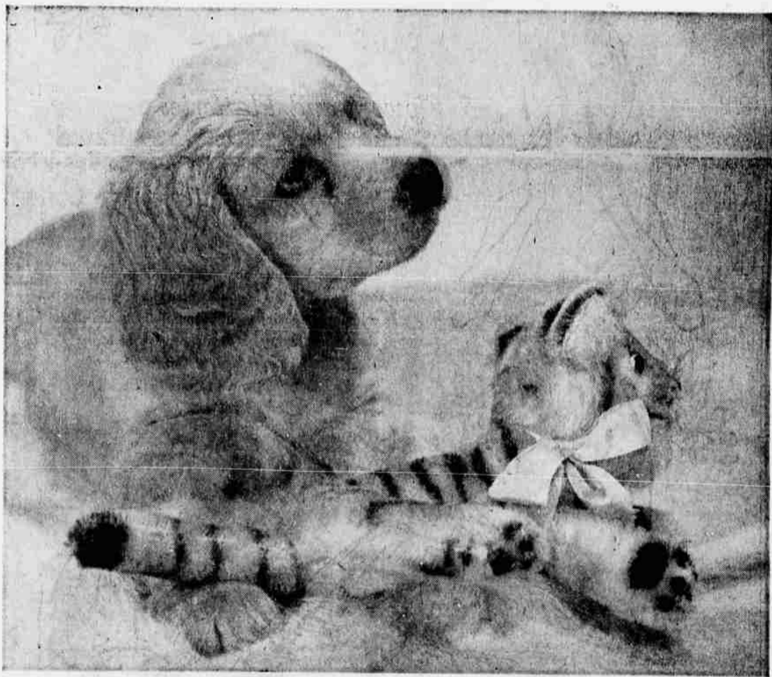
"Whaddaya mean smile . . . this is no laughing matter . . ."