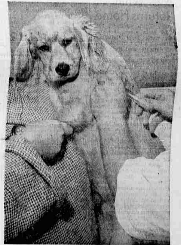
"Ouch! Watch it with that needle doc."