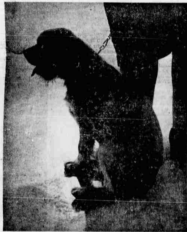
"This doesn't look dignified, but my dogs hurt."