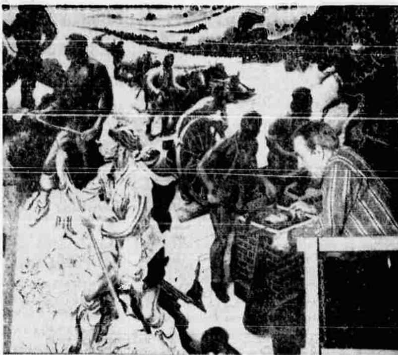
PREPARES MURAL - Kansas City artist Thomas Hart Benton is shown working on his mural for the Truman Library at Independence, Mo. Benton doesn't expect to finish the work for many months.

*Make a topping by blending two cups shredded cheddar cheese, one well beaten egg, four tablespoons dairy