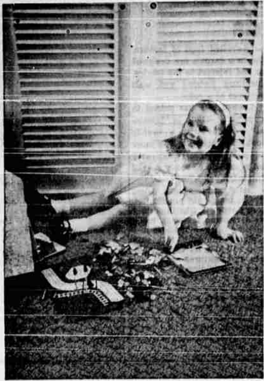
SAFE PLAY AREA —Even the youngest lady of the house appreciates carpet on the floor—it provides a safe comfortable play area for her. She and mother can pick up toys easily, too, for constant good looks.