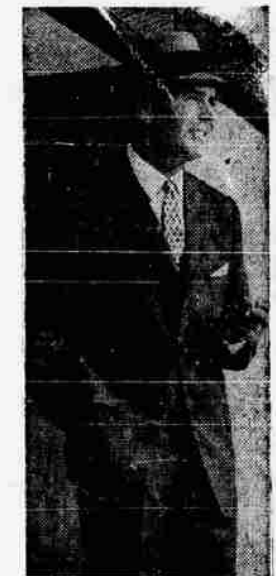
BUSINESS SUIT —A sophisticated look marks wash and wear business suits for Spring. Slate brown fabric is a blend of "Dacron" and "Orlon." It shows the drape and appearance of conventional tropical suitings. Suit by Deansgate.

Carpets are currently joined by hand and machine sewing or by special tapes that are anchored to the carpet backing by adhesives. Carpet layers employing these techniques are expert craftsmen. They are best qualified to advise homemakers on where to place the seams and what seaming methods should be used. Their advice is invaluable for obtaining a beautifully finished carpet installation at the lowest possible cost.