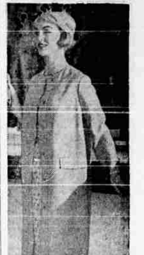
MATERNITY COAT —This pretty maternity coat can top all of your new Spring outfits. It is designed in Stehli pure silk linen fabric, and styled with a cardigan neckline, sleeves and "fake" pockets with flaps. By Mrs. Gee.

Thus, shoppers this year will still look for the new colors and textures which are best in providing a floor that is easy to clean; for pile surfaces which provide the most comfort and warmth underfoot. Regardless of style, these are the added bonuses of carpets and rugs, along with more quiet and more safety in the home.