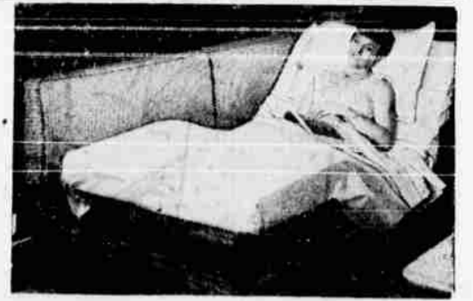
CONVENIENT —The comfort and convenience of an automatic contour bed, or lounge, once thought of as a reserved luxury is now accessible to all homemakers. This lounge can be installed in any bed or lounge frame in less than three minutes. It can be adjusted to more than 100 positions for individual comfort while relaxing, reading, television or sleeping. — The Select-A-Rest Bed Lounge by the Dura Corporation.

as the perfect gift from children to parents who know that the time of life which brings relaxation is the perfect time to enjoy carpet to the fullest extent.