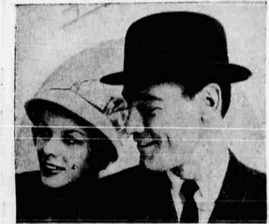
STYLED FOR LOOKS —One of the American male's hat favorites is back in a new lighter weight, styled for Spring's Continental look. This season's derby has a sleek streamlined look with narrow brim and band. Tops in comfort, this derby is made in Spring's fashion-popular color—black—and in five other style-wise hues. Derby by Knox.