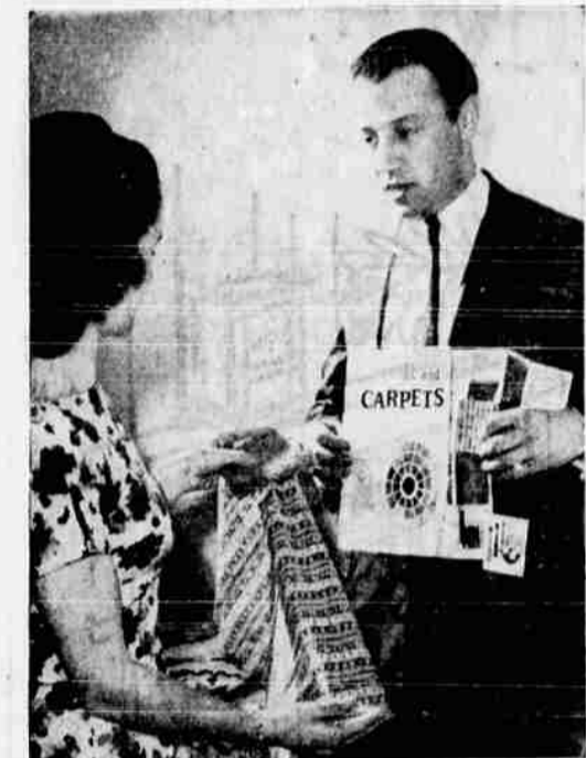
AID —A valuable aid in planning room decoration is a brochure called "Color and Carpets." Published by the American Carpet Institute, the booklet has a "clip-and-flip" section which shows how fabrics, wall colors, accessories and carpets go together in well-planned color schemes.

The exciting point about these custom services is that the prices are not much more than a home-maker would expect to pay for a running line of quality carpet.