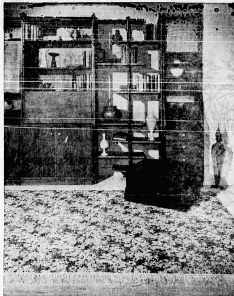
FLORAL PATTERN —A delicate, impressionistic floral pattern—but a practical texture—are outstanding features in this rug, which is fringed for added style interest. It is available in a variety of sizes and shapes to fit in with decorating schemes and methods of furniture arrangement. Here, it adds comfort and beauty to a wall unit, center of family activity.

Choose the form best for your home by considering which looks best in a particular area, and permanency of your home. If you plan to move frequently, rugs are a good choice—either room-size, with a border of floor showing, or cut to fit a room exactly, but not fastened to the floor.