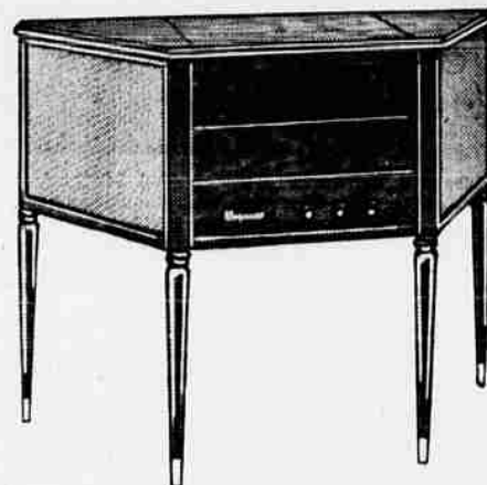
THE STEREO SYMPHONETTE

Before you buy, come in and let us demonstrate these outstanding Magnavox home entertainment values. Prove to yourself that you always get more with a magnificent Magnavox.