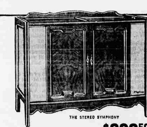
THE STEREO SYMPHONY

ALL FOR ONLY $299.50 In Traditional mahogany