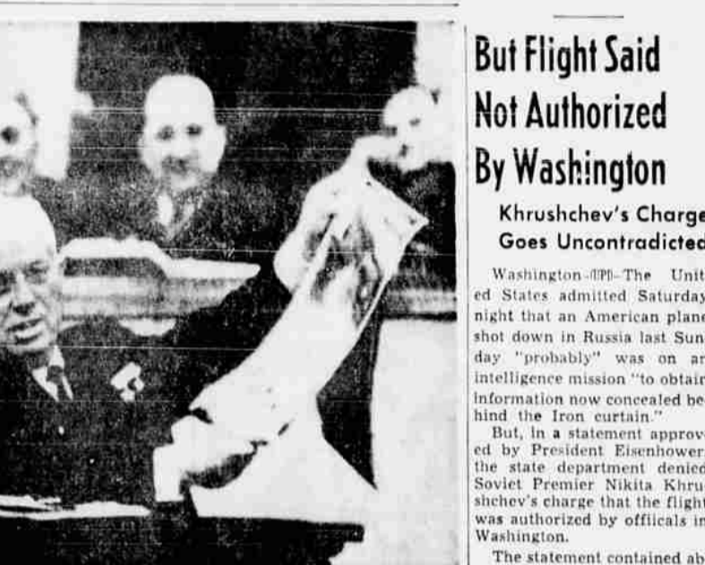
NIKITA'S EVIDENCE — Soviet Premier Nikita Khrushchev, speaking before the Russian Parliament in Moscow, holds a photograph which he identified as a picture of the wreckage of the shot-down American plane piloted by Francis C. Powers. In his speech Khrushchev revealed that Powers is alive and in good health.