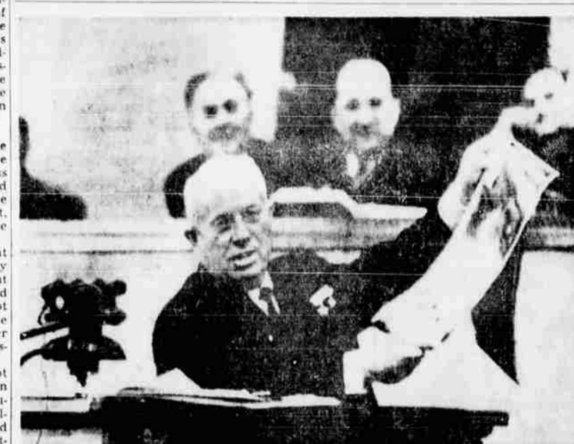
NIKITA'S EVIDENCE — Soviet Premier Nikita Khrushchev, speaking before the Russian Parliament in Moscow, holds a photograph which he identified as a picture of the wreckage of the shot-down American plane piloted by Francis C. Powers. In his speech Khrushchev revealed that Powers is alive and in good health.