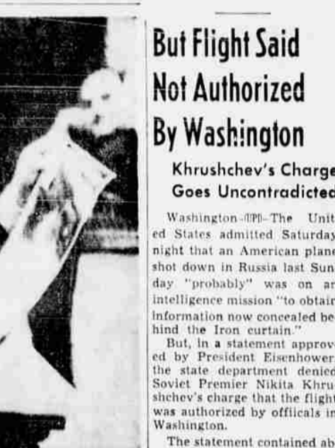
NIKITA'S EVIDENCE — Soviet Premier Nikita Khrushchev, speaking before the Russian Parliament in Moscow, holds a photograph which he identified as a picture of the wreckage of the shot-down American plane piloted by Francis C. Powers. In his speech Khrushchev revealed that Powers is alive and in good health.