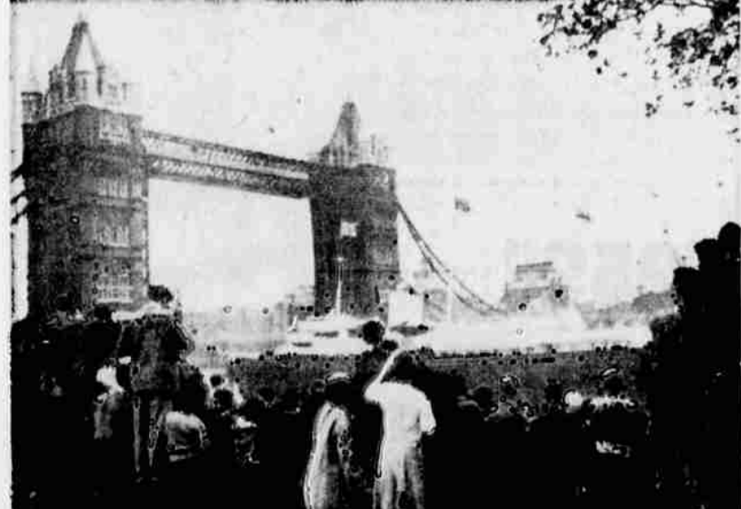
THE HONEYMOONERS—Londoners wave and sailing on the honeymoon were Princess Margaret and her husband, Antony Armstrong-Jones.

Helene Gahagan Douglas will be guest speaker, speaking on "World Peace." The dinner, which is open to the public, will begin at 6 p.m., and serving will be concluded by 7.