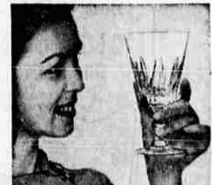
GLASSWARE SO CLEAR YOU'LL HAVE TROUBLE FINDING IT! Everything comes out FAR CLEANER than if you had washed them by hand!