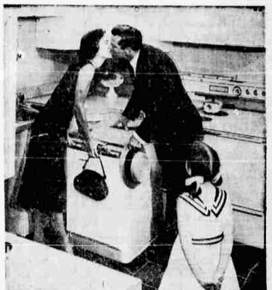
No woman will ever forget the happy day she was given a new G-E dishwasher!

Nothing could please her more . . . so give her the finest (and most practical) Mother's Day gift of all — a new General Electric Dishwasher! She'll never have to wash dishes again, and she'll never stop loving you for it! Don't wait, it's easy to buy a Dishwasher right now on easy, sensible budget terms. Be particular when you buy for her . . . get a Mobile Maid, for sure . . . and only from Hapco!