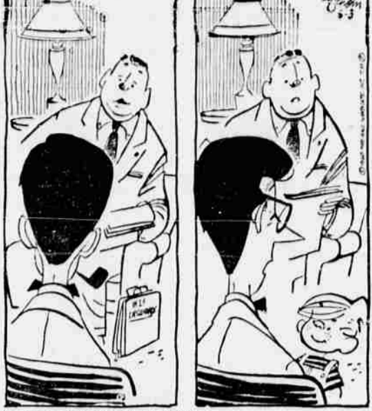
LET'S SAY THE BOY LEFT A ROLLERSKATE ON YOUR FRONT STEPS. WHICH IS POSSIBLE. . . . "PROBABLE."