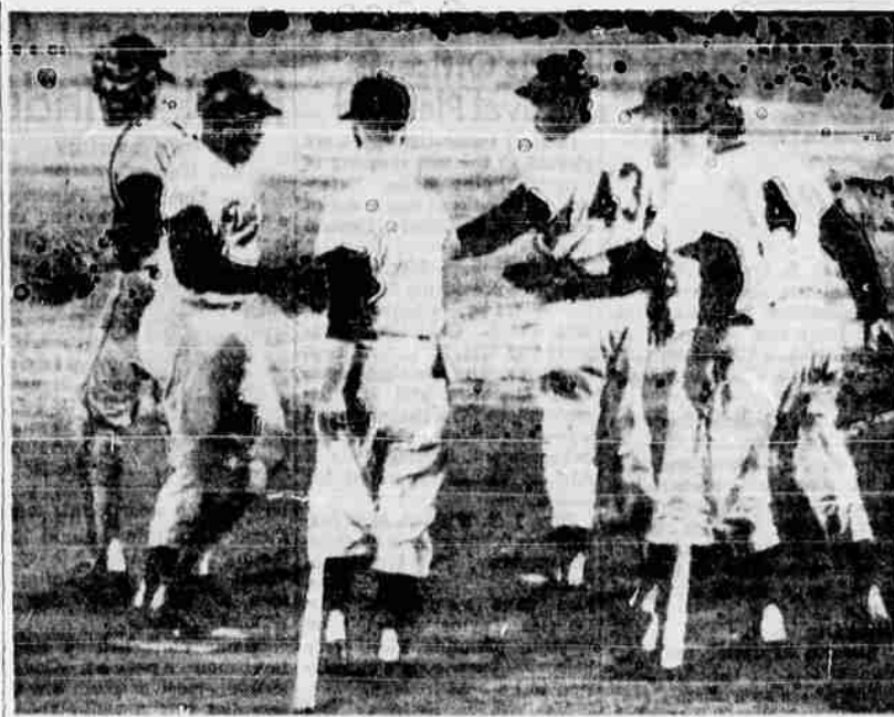
BIG HIT — Los Angeles Dodgers catcher John Roseboro (11), gets a big handshake from three teammates after hitting the first grand slam home run for the Dodgers since Aug. 23, 1958, and the first grand slammer of his major league career. The hit came in game with the San Francisco Giants, which Dodgers won 9-2.