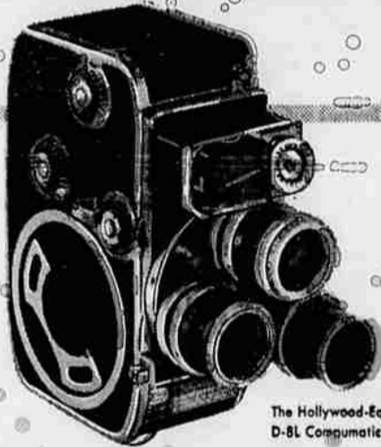
The Hollywood-Equipped B-8L Compumatic

BOLEX HIGH SPEED BLACK AND WHITE AND COLOR PHOTO FINISHING CHECK OUR NEW LOW PRICES