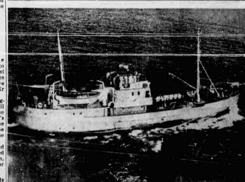
SNEAKY TRAWLER—This Soviet trawler, identified as the Vega, was photographed off Long Island, N. Y. last Tuesday within a mile of tests being conducted by the Polaris missile submarine George Washington. The Navy said she was in international waters about 60 miles south of Long Island. Photograph was taken from a Navy ship based at Lakehurst, N.J.