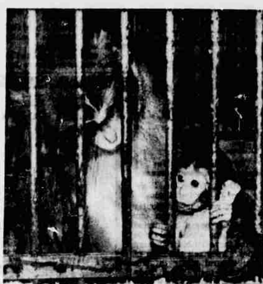
SPACE MONKEY NOW PAPA —Mike, the space monkey who gained fame by reaching an altitude of 37 miles in an Aerobee rocket, is a proud papa. He and the new offspring, as yet unnamed, are shown at the Washington, D. C., zoo.