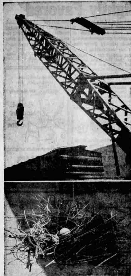
CRANE NEST - PIGEON EGG - The prospective pigeon mother who abandoned the lone egg below did so only after frustrating attempts to keep up with the portable nest she constructed on Tru-Mix Concrete company crane. The hapless mother followed her product from the Tru-Mix yard on McAndrews rd. to a new location on West Main st. near Front st., and back to the yard again. Monday afternoon she apparently gave up her domestic duties after thoughtful workman moved her home to a more stationary, less dangerous site on a nearby piece of equipment. She was no homing pigeon, anyway.