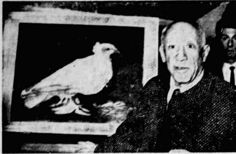
ONE-MAN SHOW — Pablo Picasso, sometimes considered the greatest living artist, is to be given a one-man show at the Tate Gallery in London this summer. His works are to be insured for something like $30,000,000. Picasso is shown posing near one of his more famous works, "Dove of Peace." Art galleries and collectors from at least 19 countries are preparing to send some 250 of his works to the show.