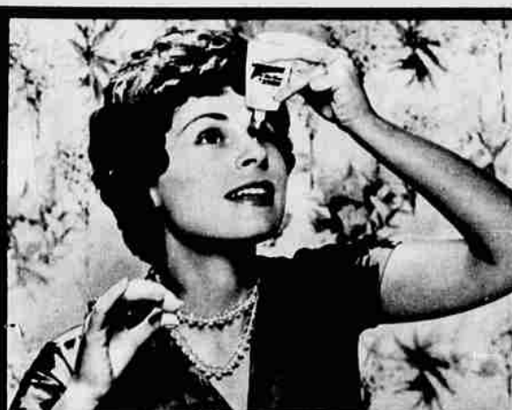
ROBERTA PETERS, OPERA, TV AND CONCERT STAGE