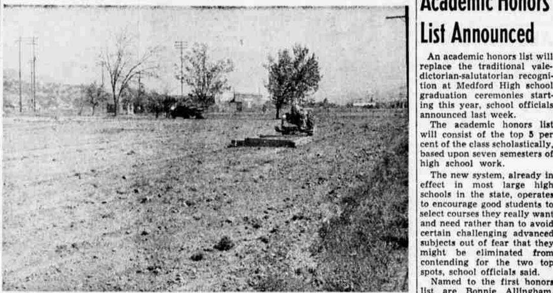
LEVELING FIELD —Work at the National Guard armory south of Medford included leveling the ground as well as removing limbs and other material collected on the weeds and other debris. Shown above is a

program. Similar work was done along other sections of North Riverside ave.