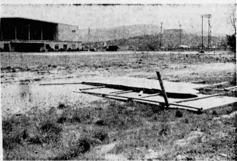
ARMORY GROUNDS — Members of the Oregon National Guard cooperated in cleaning up the armory grounds south of Medford late last week as part of the Medford Jaycee community development program. Jaycees are concentrating on cleaning up

ing as part of the Medford Jaycee community development program to make Medford the "Cleanest City in Oregon."