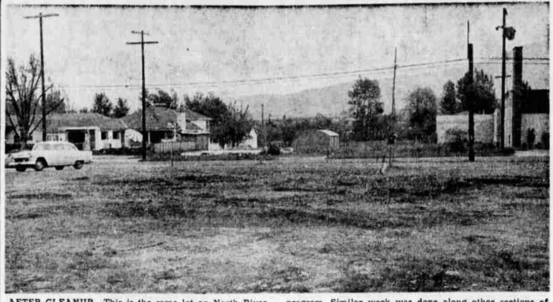
AFTER CLEANUP —This is the same lot on North Riverside ave. after the Medford Jaycees completed its cleaning operation there as part of the community development

The Jaycees hope to make the community development project a continuing program to help keep Medford an attractive community, not only for tourists, but also for the residents themselves.