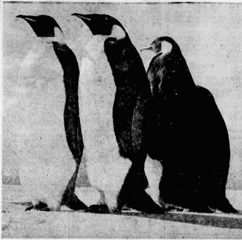
OFFICIAL GREETERS—The official "greeters committee" of Antarctica prepares to meet participants of Operation Deep Freeze 1960 when they enter the Bellingshausen sea aboard the icebreakers, USS Glacier and USS Burton Island. These birds of distinction, penguins, are the aristocrats of the bird world, and stand in a class by themselves as one of the four great super-orders of birds. There are numerous varieties of penguins throughout Antarctic and the South Pacific area.

The story which sent many of us scurrying to our history reference books followed: "Oceanographers aboard the United States Navy icebreakers Glacier and Burton Island will, during the