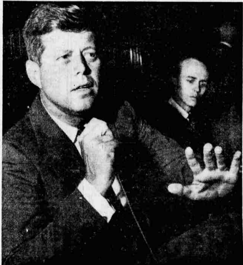
PRIMARY SIGNIFICANT —Sen. John Kennedy (D-Mass.) said at an airport press conference in Portland this morning that the Oregon presidential primary May 20 may be the most significant in the country because of the number of candidates entered. Kennedy will be in southern Oregon Saturday and will be grand marshal of the Pear Blossom parade.

Prior to the parade, between 1:15 and 2:15 p.m., Senator Kennedy will be at a public reception at the Medford hotel. He will leave Medford via plane at 3:30 p.m. for Portland, where he is scheduled to speak Saturday night.