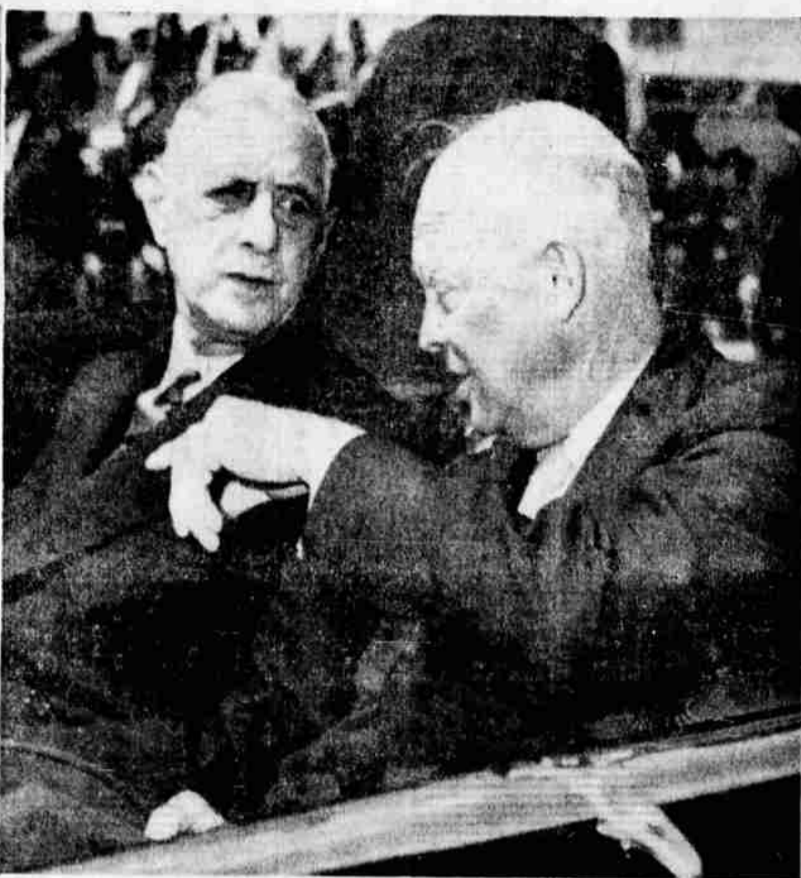
SERIOUS TALKS — President Eisenhower and French President Charles de Gaulle appear in serious conversation as they begin a motorcade into town from the Washington airport this morning.

FORECAST: Partly cloudy tonight and Saturday. A little warmer Saturday. Low tonight 36-38. High Saturday 68. Highest Yesterday 47 Lowest this Morning 29 Prev. to 10 a.m. Today 32 Our Skies Tonight Sunset today 7:01 p.m. Sunrise tomorrow 5:18 a.m. Moonrise tomorrow 4:23 a.m. New Moon April 25 PROMINENT STAR Spica, in the south, 8:44 p.m. VISIBLE PLANETS Jupiter, rises 12:14 a.m. Saturn, rises 4:05 a.m. Mars, rises 4:05 a.m.