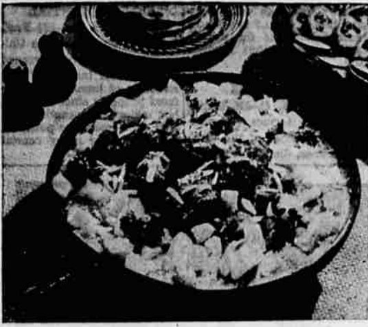
FLAVORFUL EATING —These Mexican meat balls in almond sauce (Albondigas en Salsa de Almendra) make hearty, flavorful eating; economical and festive, too. They're a good way to start the family on foreign food favorites.