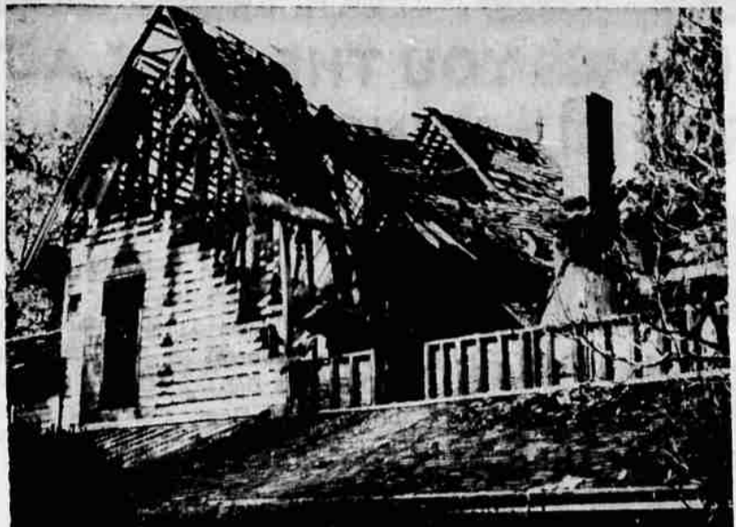
CHARRED REMAINS —After two serious fires, Jacksonville's historic Britt house is left more than a fire-charred skelton. The old home will be destroyed prior to June 1, according to a recent agreement between the Jacksonville city council and Southern Oregon college, owner of the house. Both the council and college agreed the house is a safety hazard and must come down.