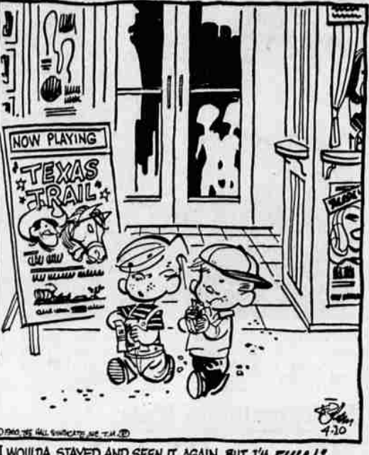
"I WOULD'VE STAYED AND SEEN IT AGAIN, BUT I'M FULL!"