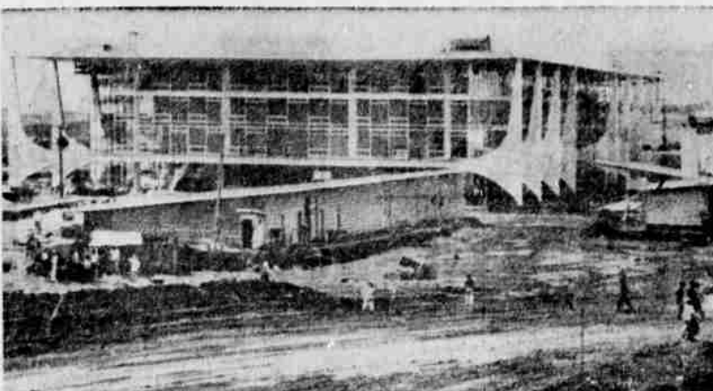
TO INAUGURATE CAPITAL—About 30,000 people will travel into the interior of Brazil Thursday to inaugurate the country's new capital at Brasilia. However, Rio de Janeiro will remain an unofficial capital because of lack of completed facilities at Brasilia. Here's a view of the "Palacio dos Despachos," presidential office building, seat of the executive branch of government, still under construction.

NEW RUGS from scrapst Clear instructions tell how to weave, braid, hook, or crochet rugs at so little cost. Pattern 7331: directions for 9 different rugs; necessary patterns and a list of materials included. Make a "rag" rug. Send THIRTY-FIVE CENTS (coins) for this pattern - add 5 cents for each pattern for 1st-class mailing. Send to Medford Mail Tribune, Household Arts Dept., P.O. Box 188, Old Chelsea Station, New York 11, N.Y. Print plainly NAME, ADDRESS, PATTERN NUMBER. JUST OUT! Our New 1960 Alice Brooks Needlecraft Book contains THREE FREE Patterns. Plus ideas galore for home furnishings, fashions, gifts, toys, bazaar sellers - exciting, unusual designs to crochet, knit, sew, embroider, huck weave, quilt. Be first