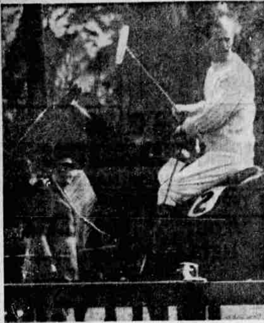
READY FOR POLO—With polo stick high, the Duke of Edinburgh sits astride one of his polo ponies as he is ready to play for the Welsh Guards in the first round of the Combermere Cup against Whipsnade at Windsor Great Park in London.

MEDICAL BILL New York—UPI—Americans are spending a staggering $22 billion a year for medical services—double the 1950 amount and more than 6 1/2 times the 1929 total, according to figures of the American Newspaper Publishers Association. SUNDAY PAPER Baltimore—First Sunday newspaper in the U.S. was the Monitor published here in 1786. BUSHEL CONTENT Washington—A standard bushel in the United States contains 2,150.42 cubic inches. An imperial bushel used in England and some other countries contains 2,218.192 cubic inches. MAP DISTANCES Washington—The greatest distance, east to west in the U.S. proper is about 3,100 miles. From north to south the maximum span is about 1,700 miles. BASHFUL CAVE DWELLER Lewiston, Idaho—UPI—One entry on the 1960 census for the Juliaetta area north of here is likely to read: "Unknown man. Dwelling, cave." Roy Mossman, north Idaho census supervisor, said Monday that is the only way they can list the man who flees everytime a woman census enumerator approaches his cave to question him. Use Tribune Want Ads