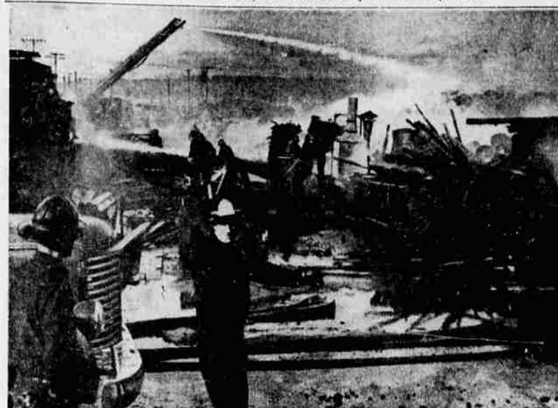
WATERFRONT FIRE —An unidentified fire officer directs fighting of a four-alarm fire which struck during the evening rush hour at the Oakland Dock and Warehouse Company on the Oakland, Calif., waterfront. Flames that shot 300 feet into the air and smoke that went higher was visible from practically all the Bay area and rubbernecks made the already difficult traffic situation even worse. Reports stated that the fire was in an area being cleared for new construction and that no valuable property was in immediate danger.

MEDFORD, OREGON, WEDNESDAY, APRIL 20, 1960