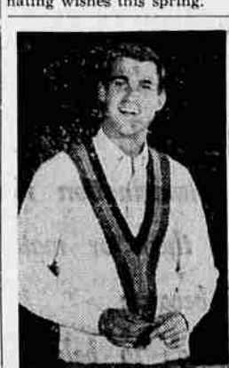
FOR SPORTS — Strictly for sports this practical low-Vee sweater is perfect for indoor or outdoor activity. Fashioned of 75 per cent lambswool and 25 per cent "Orlon," it is comfortable and always stays smartly in shape. Sweater by McGregor.

It really looks as though the American male can perfectly suit his most discriminating wishes this spring.