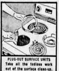
PLUG-OUT SURFACE UNITS Take all the tedious work out of the surface clean-up.