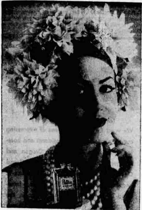
FLOWER SHOW —Most flattering accessories—a lovely new hat and a lovely fragrance! The hat is truly a flower show of posies, designed to balance the softer Spring silhouettes. The perfume—a French import—is a well-balanced blend of many fragrant notes.—“Flatterer” Perfume by Houbigant. Hat by Sally Victor.