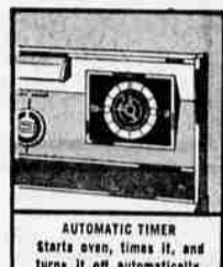
AUTOMATIC TIMER Starts oven, times it, and turns it off automatically.