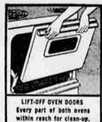
LIFT-OFF OVEN DOORS Every part of both ovens within reach for clean-up.