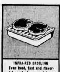
INFRA-RED BROILING Even heat, fast and flavorful, seals in meat juices.