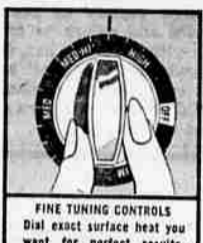
FINE TUNING CONTROLS Dial exact surface heat you want for perfect results.