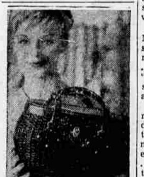
ROOMY BAG —Fashion is on hand in creating this roomy straw and cowhide bag. Fashioned with a lid that locks securely; detailed with hoop-like handles that make toting a treat. By Park Lane.

New on the American fashion scene are suits with short sleeves. These are usually chopped at the elbow! (Of course there will be many traditional length and full length sleeves, too) — but the to-the-elbow sleeve is newest.