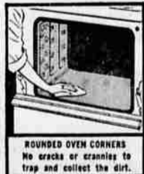
ROUNDED OVEN CORNERS No cracks or crannies to trap and collect the dirt.