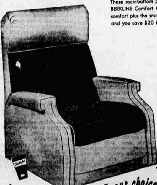
These rock-bottom prices are on top-quality BERKLINE Comfort Chairs. Here's man-sized comfort plus the smart styling women love — and you save $20 if you buy now!

Pear Blossom Festival SPECIAL FREE Vibrator WITH PURCHASE OF ANY CHAIR BELOW