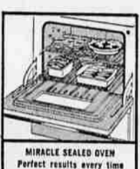
MIRACLE SEALED OVEN Perfect results every time . . . the heat's locked in.