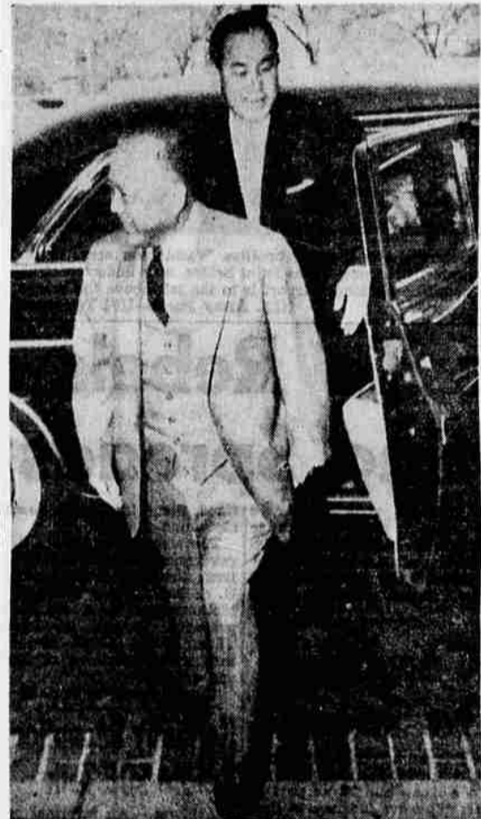
ENVOY CALLED IN—Korean Ambassador You Chan Yang arrives at the State Department in Washington. He was called in by Secretary of State Christian A. Herter to discuss the student riots in Korea. The United States called on both the Korean government and anti-government demonstrators to settle "justifiable grievances" without further bloodshed. The man behind Yang is unidentified.