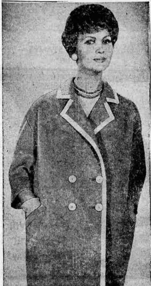
'THE' COAT FOR SPRING 1960—One of the newest looks in coats for the coming season is the double-breasted design with braid trim outlining the front. Style shown here is in camel hair; features white braid and buttons.—By Originals

Greys - from light to dark, grey is seen in woollens primarily - especially the beige-grey - called greige, or combined with pastels in plaids and stripes; blacks are big when combined with white or the new pale tones; bright, hot shades blaze at their best in night settings but generally it's the great white way and the pale-glowing pastels that are making exciting fashion copy this season!