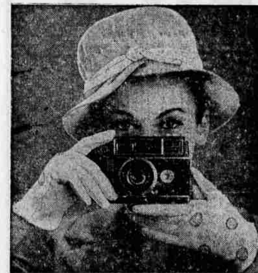
NEW GLOVES —Catch the spring scene with a camera in hand with these new short slip-on gloves! Designed with cut-out circles in a choice of self or contrasting fabric on the back of the hand, they come in white double-woven cotton with black patent leather trim or other pale pastels.—Signet 80 Camera by Kodak.—Gloves by Dawnelle.