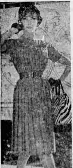
PLEATS THAT PACK —The yoke-to-hem pleats in this smart dress are here to stay, thanks to Kodel, an Eastman polyester fiber. The dress has a look of both softness and crisp freshness. By Genevieve Originals.

Medford Pharmacy Corner 6th & Central Open Daily 8:30 a.m.—10:30 p.m. Sundays 10 a.m. to 9:30 p.m.