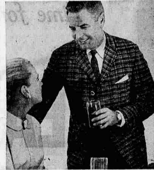
CASUAL LOOK — Madras styling, an important part of the casual, colorful look for men this Spring, makes unique appearance in lightweight sport coat of "Orlon" blended with wool. Burgundy, charcoal and gold compose distinctive color scheme on soft, shape-holding fabric. By Stanley Blacker.

PARADE FORMATION, ROUTE — Shown above is the formation area for the Pear Blossom Festival parade Saturday. The first section will form on Ivy st. between Fourth and Sixth sts., headed south, and the second section will form on Fifth st. between Oakdale ave. and Holly st. facing toward Ivy st. Marching bands will form on Ivy st. between Main and Eighth sts. The first section of the parade will include children up to sixth grade age and non-motorized floats. The second section will include all children seventh grade age or older and motor powered vehicles. Information booths will be located at Main and Ivy sts. and at Sixth and Ivy sts. The parade will proceed east on Main st. to Hawthorne park, indicated by the larger arrows on Main st. Normal westbound traffic on Main st. will be rerouted north on Hawthorne ave. to Jackson st.