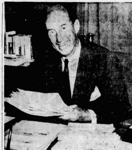
URGED TO RUN — Adlai Stevenson, twice a Democratic Presidential candidate, is shown in his office at Chicago after returning from a two-month tour of Central and South American countries. His desk is piled high with letters from people all over the country who urge him to run again.