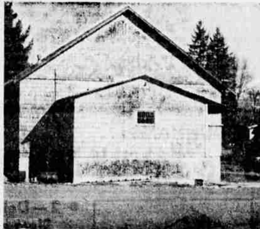
BUTTE FALLS COMMUNITY HALL Work May Be Completed This Year

All 20 organizations in Phoenix are asked to make sure their delegates are present. If the regular club delegate cannot attend, an alternate should be sent, a spokesman said.