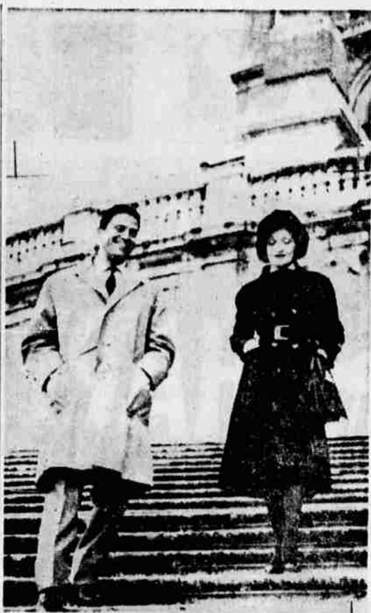
MARLENE'S RETURN PROTESTED - Marlene Dietrich, shown enjoying a stroll with Italian star Faf Vallone, is planning to return to Germany. Miss Dietrich, whose support of the Allied cause in World War II won her the French "Croix de Guerre" and friends almost everywhere outside Germany, soon will perform in Germany for the first time in 30 years. She is scheduled to appear at least twice - in Berlin April 30 and Hamburg May 7. But already many Germans, accusing the blonde grandmother of being anti-German, are protesting her return.

RAILROADS SPEND Washington - (UP) - Despite their return of only 2.8 percent on net investments - about one-third the profit rate in manufacturing - railroads managed to spend about $830 million for capital improvements of plant and equipment in 1959, according to the Association of American Railroads. The total included some 800 diesel electric locomotives and more than 40,000 new freight cars.