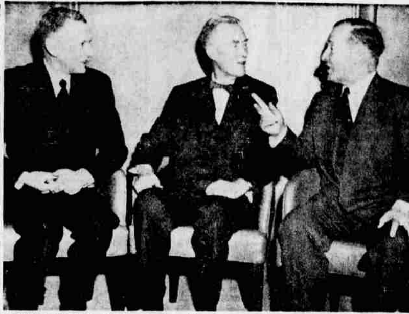
MINISTERS MEET —Western foreign ministers pose for photographers at the State Department in Washington prior to start of consultations on Western strategy to meet Soviet Premier Khrushchev's unknown plans for the summit conference next month.