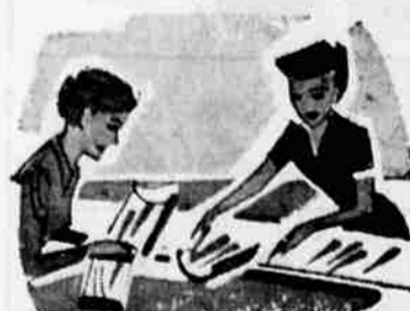
Speed counts in packaging. SNOBOY doesn't waste a second in packaging. Directly after washing and ice-water cooling, carrots—like other SNOBOY vegetables—are hand-packed... to be delivered to your store in perfect condition—fresh, crisp, flavorful!