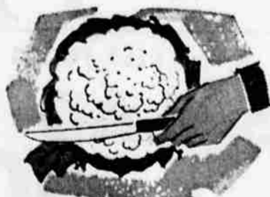
Speed counts in trimming. Vegetables, like this cauliflower, are hand-selected, then expertly hand-trimmed... no waste with SNOBOY! Not a moment is lost, no flavor escapes. For vegetables which are sized and graded, the same rule of thumb: do it fast!