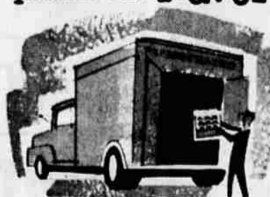
Speed counts in shipping. SNOBOY tomatoes, like all SNOBOY vegetables, are shipped in refrigerated trucks or railroad cars the same day they're picked. From field to store, speed makes the important SNOBOY difference in flavor... freshness... and crispness.