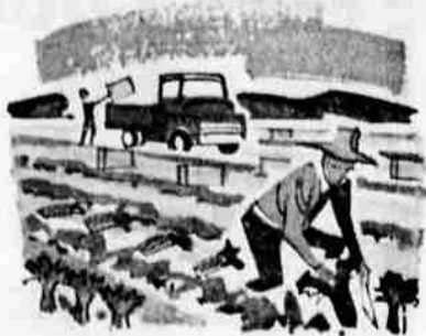
Speed counts at picking time. SNOBOY celery for instance, must be at the absolute peak of flavor before SNOBOY inspectors say "pick." But once that time arrives, it's harvested in a hurry... to make sure all that famous SNOBOY "picked-for-flavor" quality reaches your table.