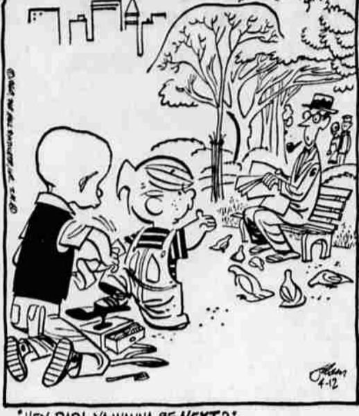
"HEY, DAD! YA WANNA BE NEXT?"